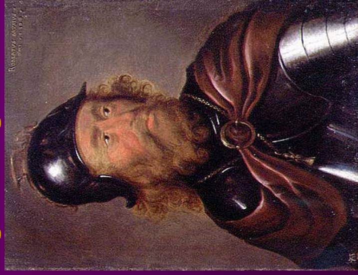
King Robert Bruce of Scotland