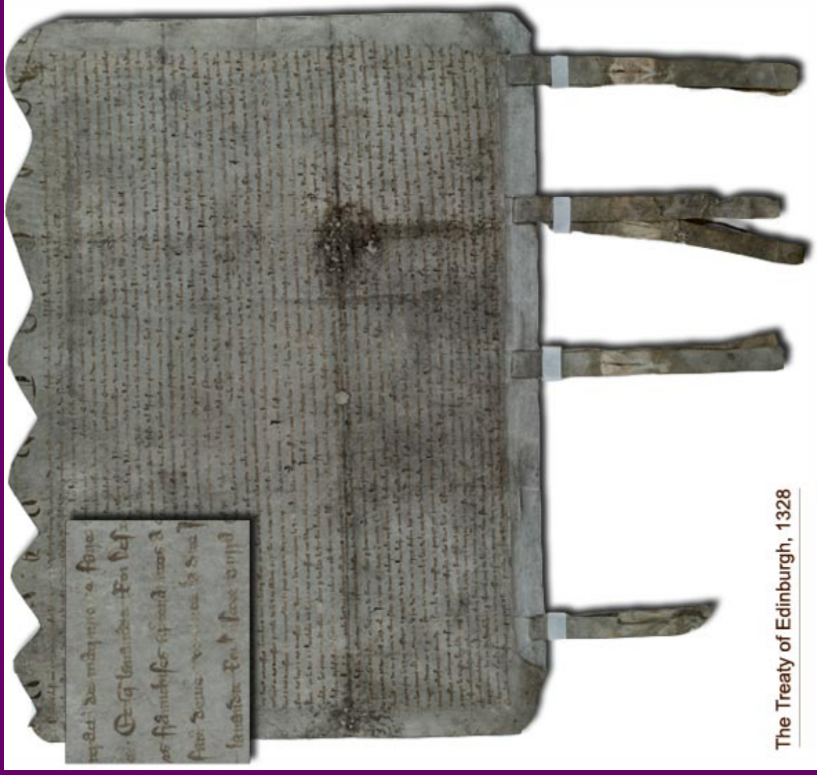
The Treaty of Edinburgh, 1328