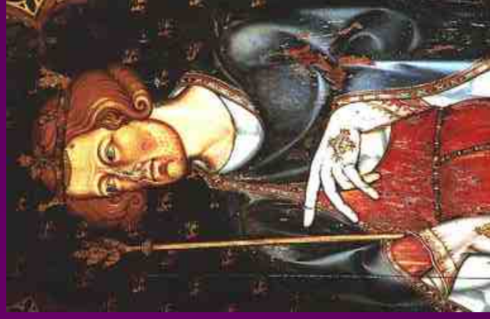
King Edward I of England