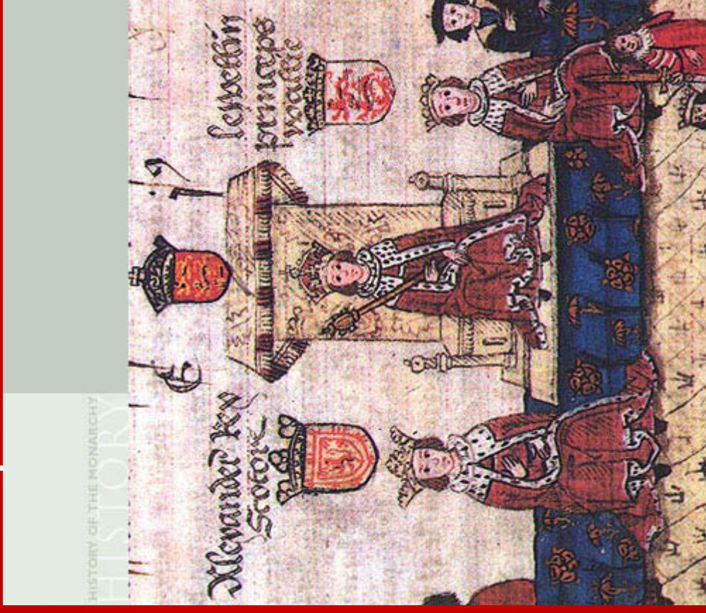
Edward I in Parliament from the Wriothesley Manuscript. King Alexander of Scotland is seated on the left and Prince Llywelyn of Wales on the right.